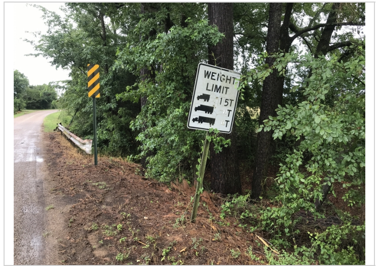
Posting beginning of bridge