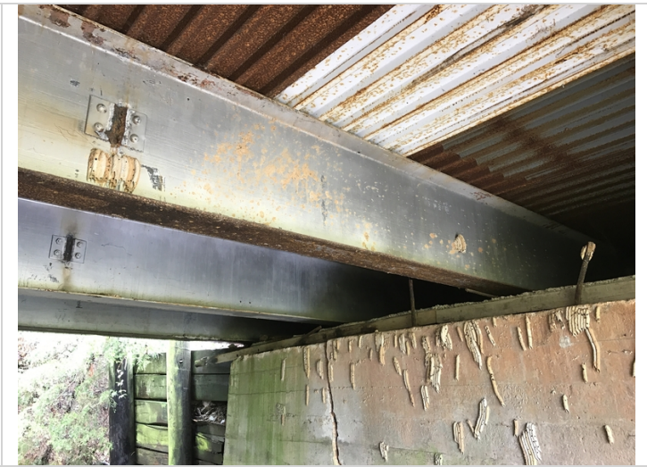
Beam 3 bottom flange has some corrosion