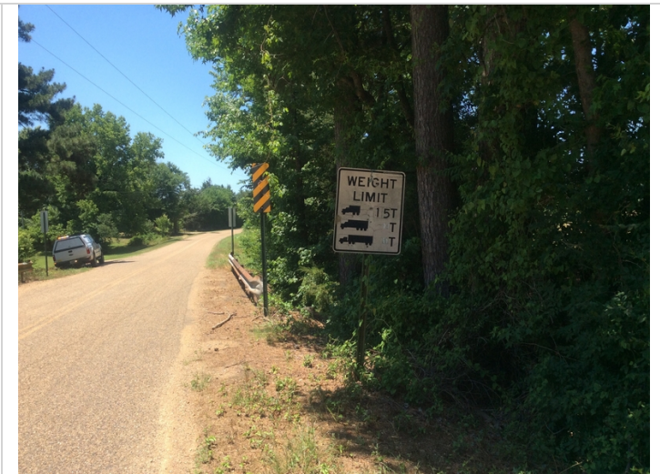
POSTING PHOTO BEGINNING OF BRIDGE